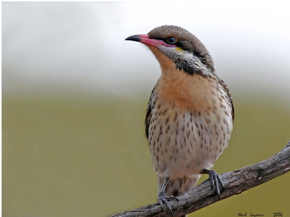
Spiny-cheeked Honeyeater